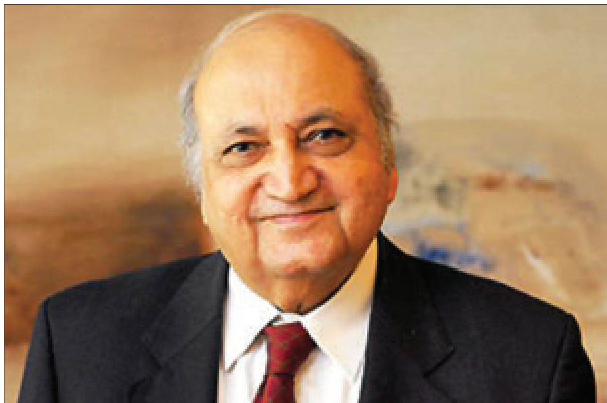
Shri Keshub Mahindra, President, Centre for Research in Rural and Industrial Development (CRRiD), Society

Shri Keshub Mahindra is currently Chairman Emeritus, Mahindra & Mahindra Limited. The CRRiD owes its origin to him for having provided unstinted financial and academic support in the growth and continuing development of the Institute to-date.